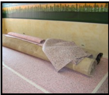
With God's perfect timing, carpet was donated to us.

We can currently seat at least thirty people now that we have just about finished decorating our "big" room. We are excited because this has opened the way for Christian school teachers, Sunday School teachers, and groups such as home school groups to come with their students. Extra instruction and teaching plus watching DVD's on creation science is now possible in this room. There is more to be done as time goes on in the way of adding exhibits.