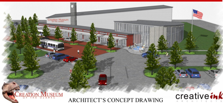
ARCHITECT’S CONCEPT DRAWING