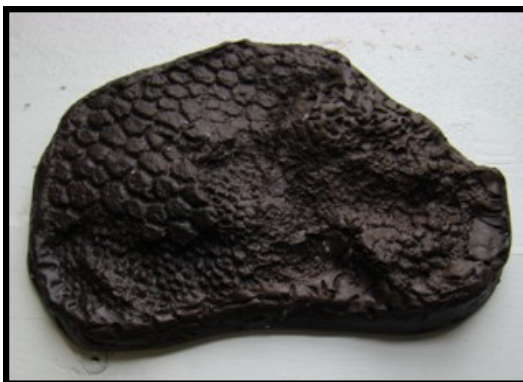
A replica of rare dinosaur skin.