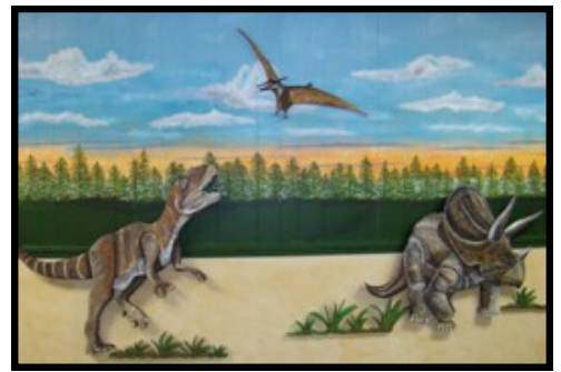
Here it is with others installed on our decorated wall.