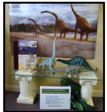
A section of our dinosaur corner.